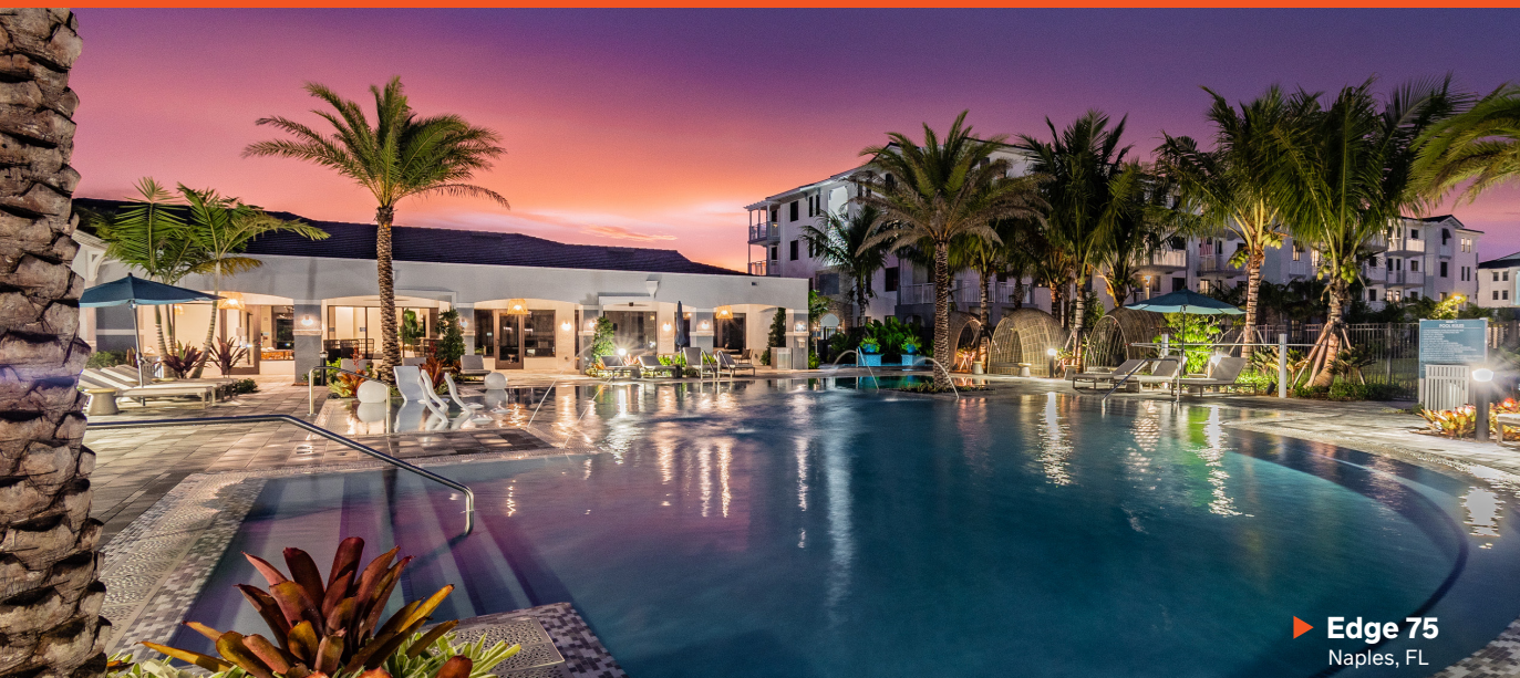
▶ Edge 75 Naples, FL