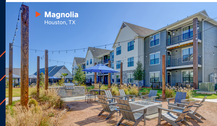
▶ Magnolia Houston, TX